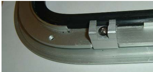
Handle catch fitted with screw

In June 2000 the portlight was changed to use screwed on hinges and handle catches that are user serviceable. The hinges and handle catches sometimes have packers under them to control the seal compression.