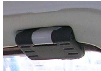
Hinge of type fitted with pressed / staking process

In June 2000 the portlight was changed to use screwed on hinges and handle catches that are user serviceable. The hinges and handle catches sometimes have packers under them to control the seal compression.