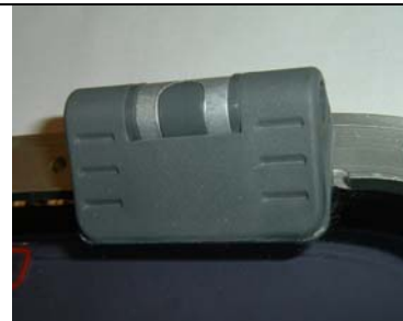
Hinge of type fitted with screw